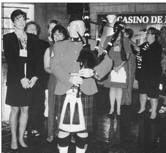
“Piping in” the NENA executive, above.